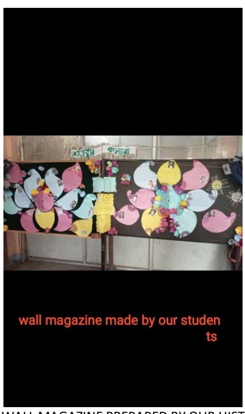
WALL MAGAZINE PREPARED BY OUR HISTORY DEPT. STUDENTS.