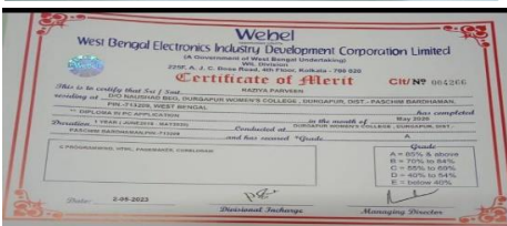
Certificates of Webel