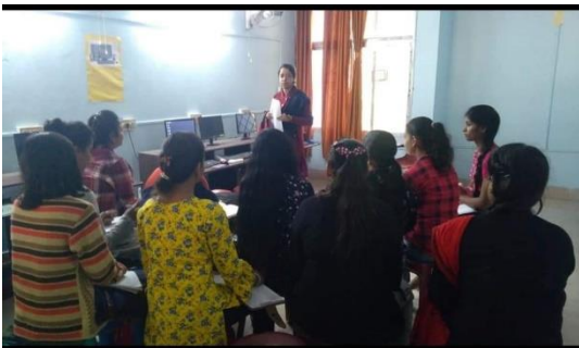
Practical class of Webel