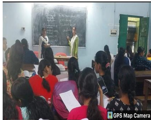
Theoretical class of Webel