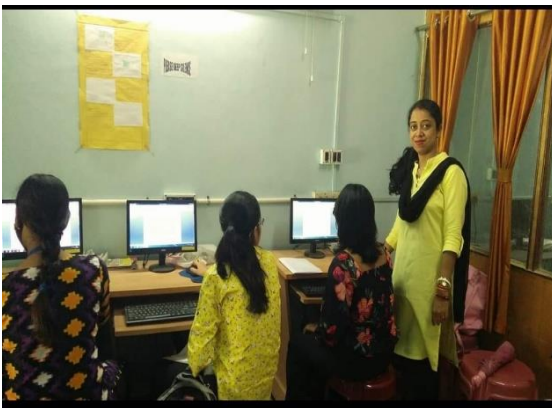
Practical Class of Webel