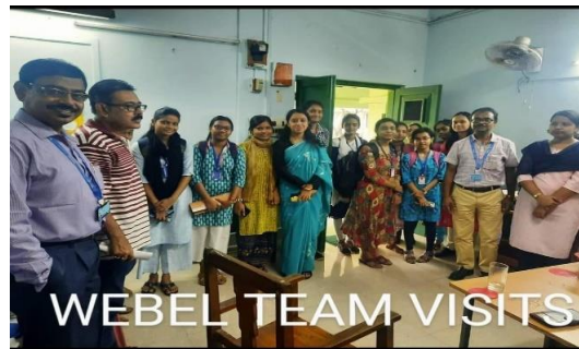
WEBEL TEAM VISITS