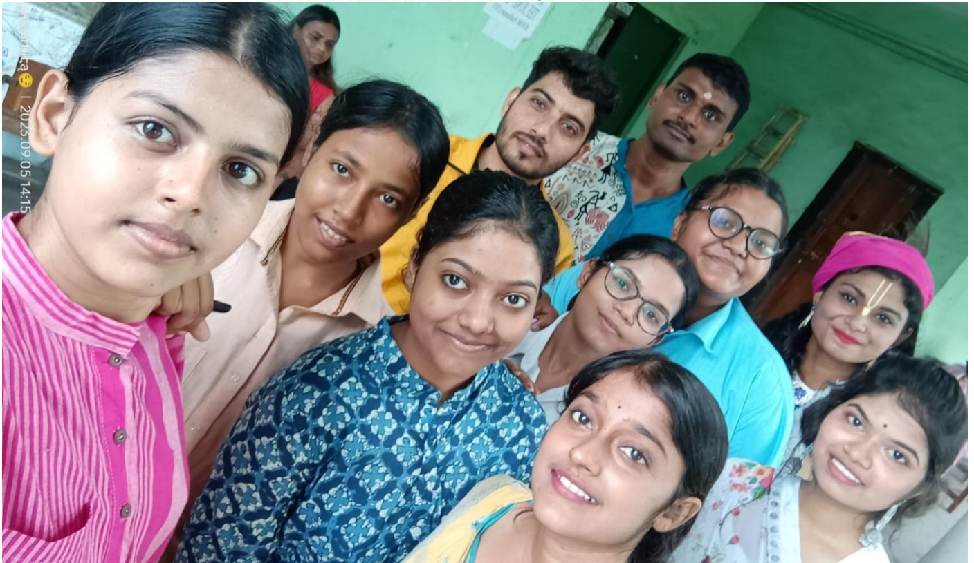
Behind the stage all the performers.

Affiliated to Kazi Nazarul University Mahatma Gandhi Road, Durgapur, W.B. 713209 e-mail : durgapurwomenscollege@gmail.com