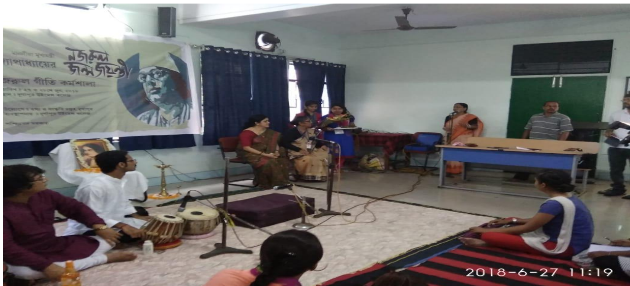
Najrul Jonmo jayanti programme at the college.