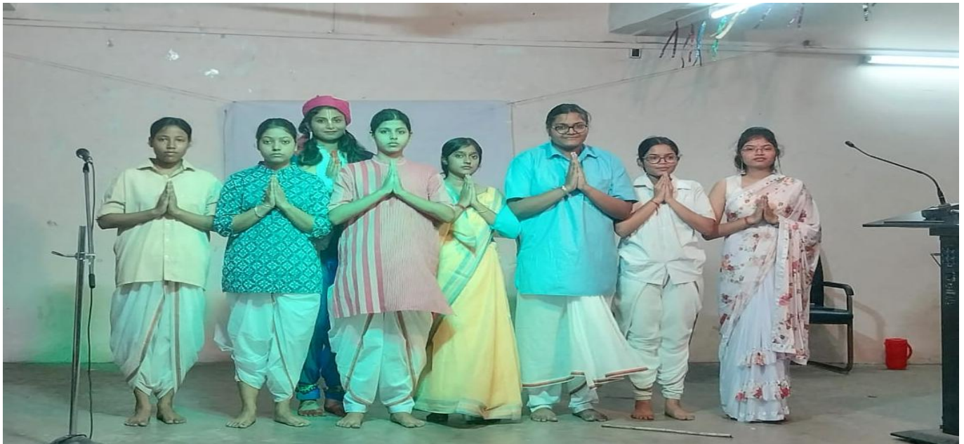
Drama program at Teachers day celebration

Affiliated to Kazi Nazarul University Mahatma Gandhi Road, Durgapur, W.B. 713209 e-mail: durgapurwomenscollege@gmail.com