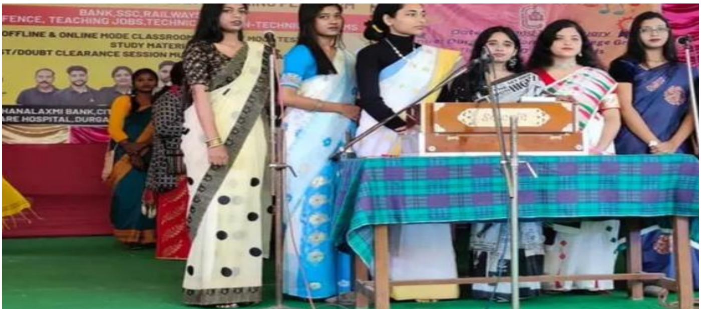
Singing programme at College social