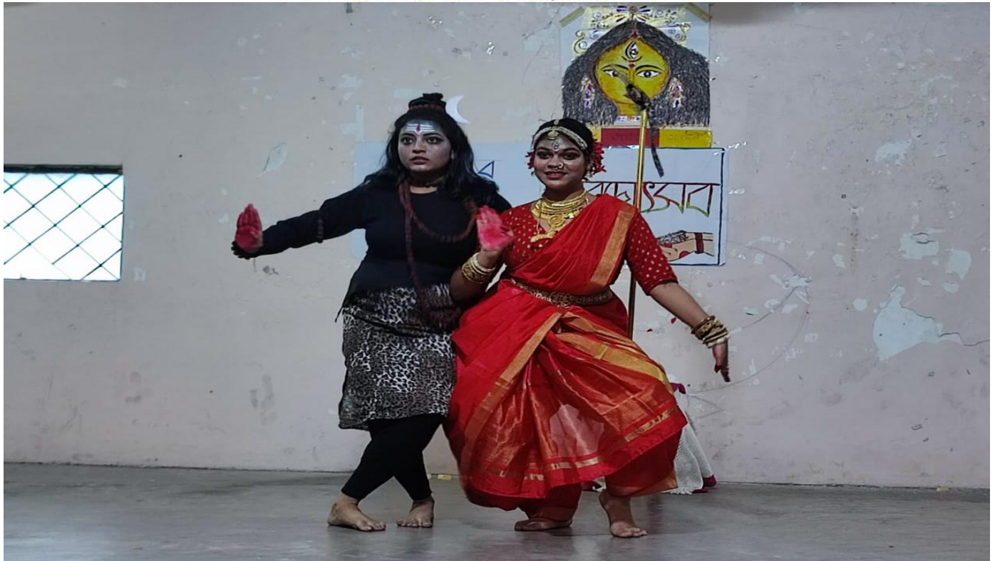
Sharadiya programme at college auditorium

Affiliated to Kazi Nazarul University Mahatma Gandhi Road, Durgapur, W.B. 713209 e-mail: durgapurwomenscollege@gmail.com