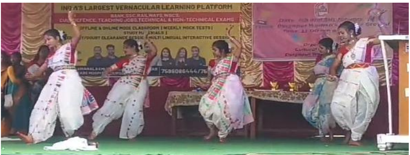
Dance program at college social