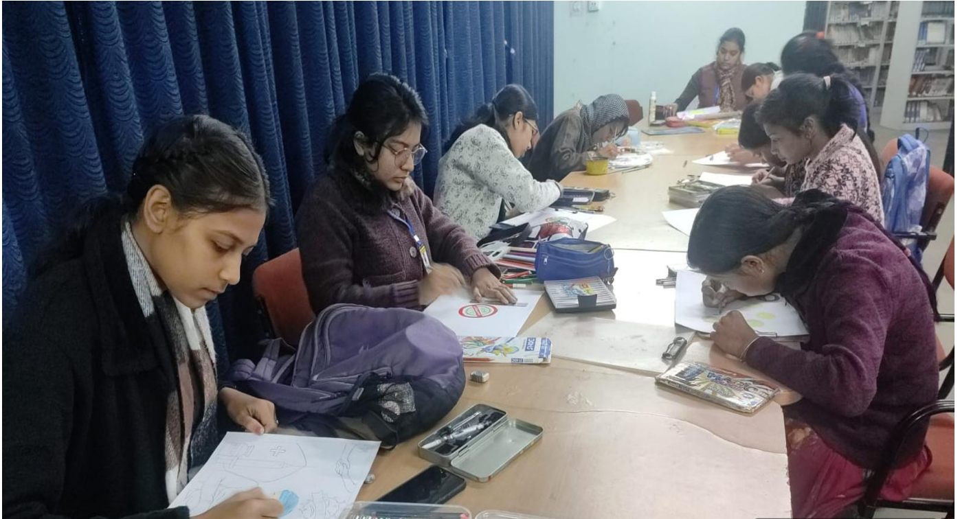
Art workshop programme at college library

Affiliated to Kazi Nazarul University Mahatma Gandhi Road, Durgapur, W.B. 713209 e-mail : durgapurwomenscollege@gmail.com