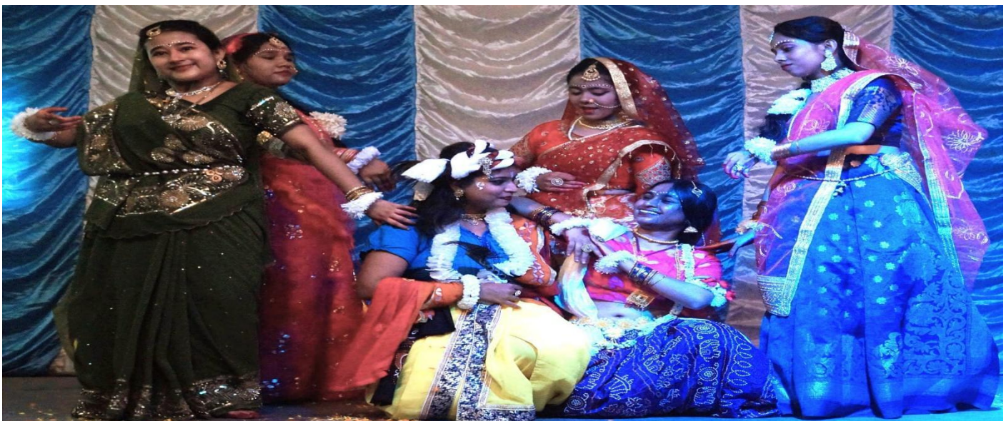
College social programme