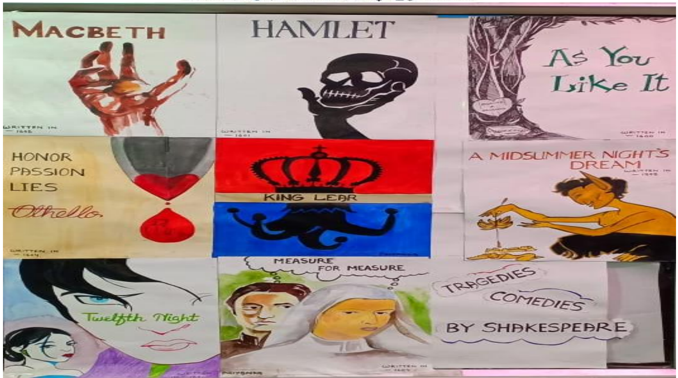
Art exhibition programme at the college.

Affiliated to Kazi Nazarul University Mahatma Gandhi Road, Durgapur, W.B. 713209 e-mail : durgapurwomenscollege@gmail.com