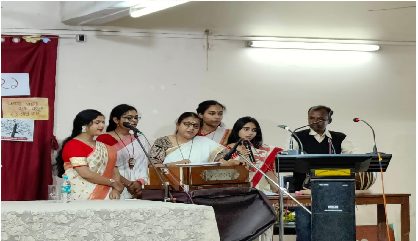
International mother tongue day celebration at College

Affiliated to Kazi Nazarul University Mahatma Gandhi Road, Durgapur, W.B. 713209 e-mail: durgapurwomenscollege@gmail.com