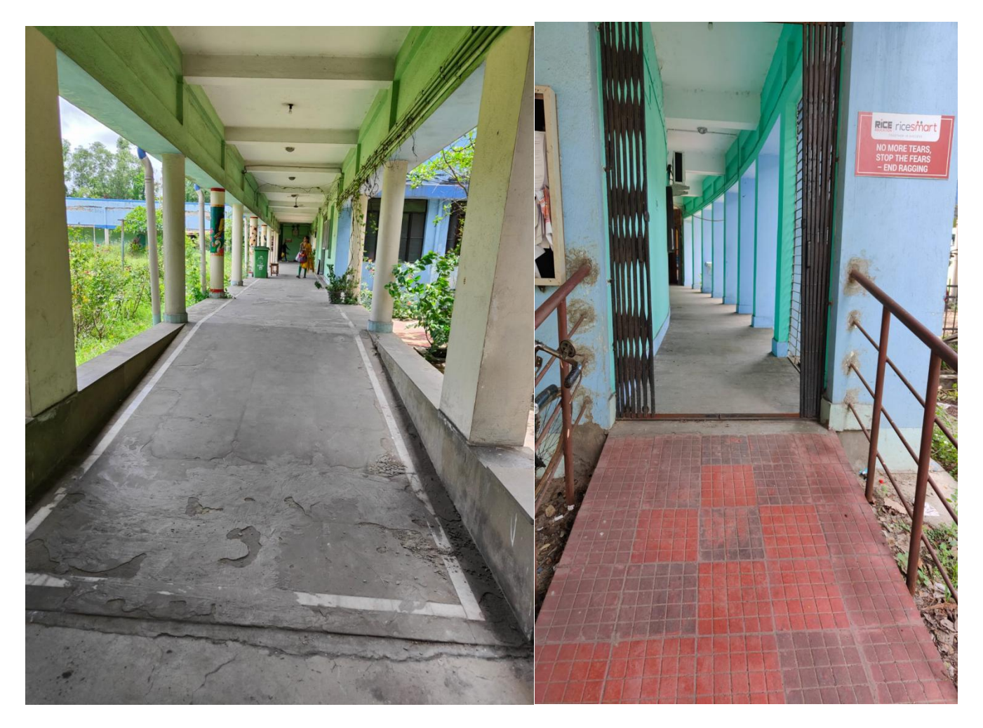
Disabled Friendly Ramp (Photograph taken on 11/06/2023)

Due to paucity of funds, the College could not undertake any initiative in the given period.