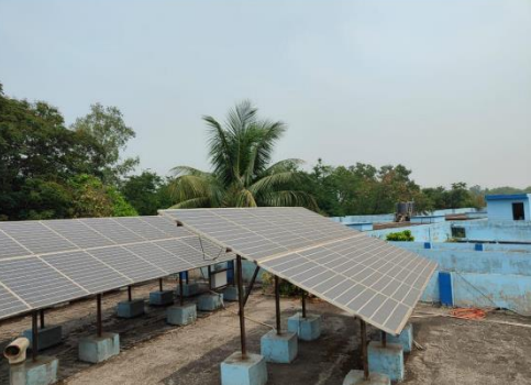
Photograph Taken on 09/04/2022