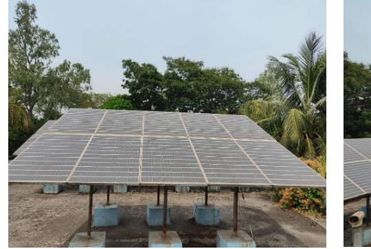
Photograph Taken on 09/04/2022

i. Alternate sources of energy and energy conservation measures.