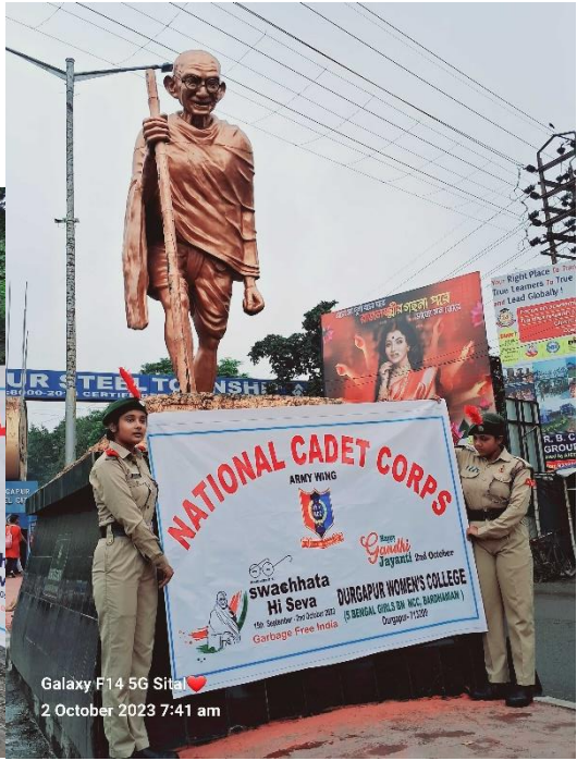
Galaxy F14 5G Sital 2 October 2023 7:41 am