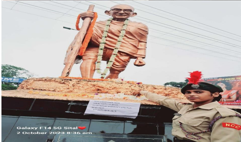
Galaxy F14 5G Sital 2 October 2023 8:36 am