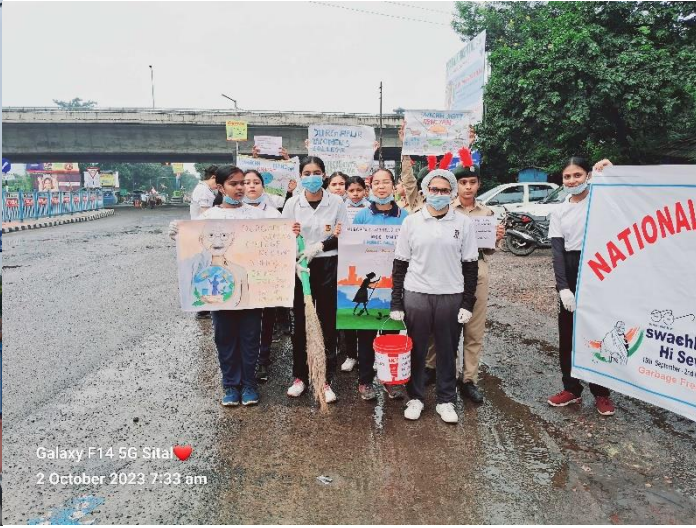
Galaxy F14 5G Sital 2 October 2023 7:33 am