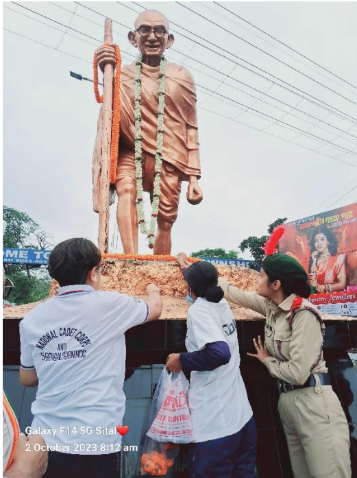
Galaxy F14 5G Sital 2 October 2023 8:12 am