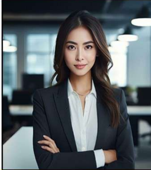
Office Executive [Management Sector]

For students of all Streams Arts / Science / Commerce